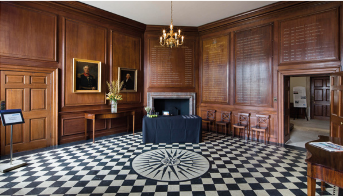
Right: The elegant rooms of Admiral's House are an important part of the Old Royal Naval College's venue hire offering.

The conservation maintaintence of the magnificent buildings and site running costs of the Old Royal Naval College accounted for 58% of our expenditure in 2016-17. Whilst we generated a healthy surplus for the 2016-17, most of this relates to restricted funds raised for the Painted Hall Project as well as the endowment. The endowment funds have been invested and will provide the Old Royal Naval College with an investment income in perpetuity, helping to maintain the Painted Hall and Chapel for future generations to enjoy. Our day-to-day unrestricted funding is coming under increasing pressure as our Grant-in-aid from DCMS continues to be cut. This is due to fall by over 30% in real terms during the current 4 year agreement, having already been reduced by over 33% in real terms since 2010.