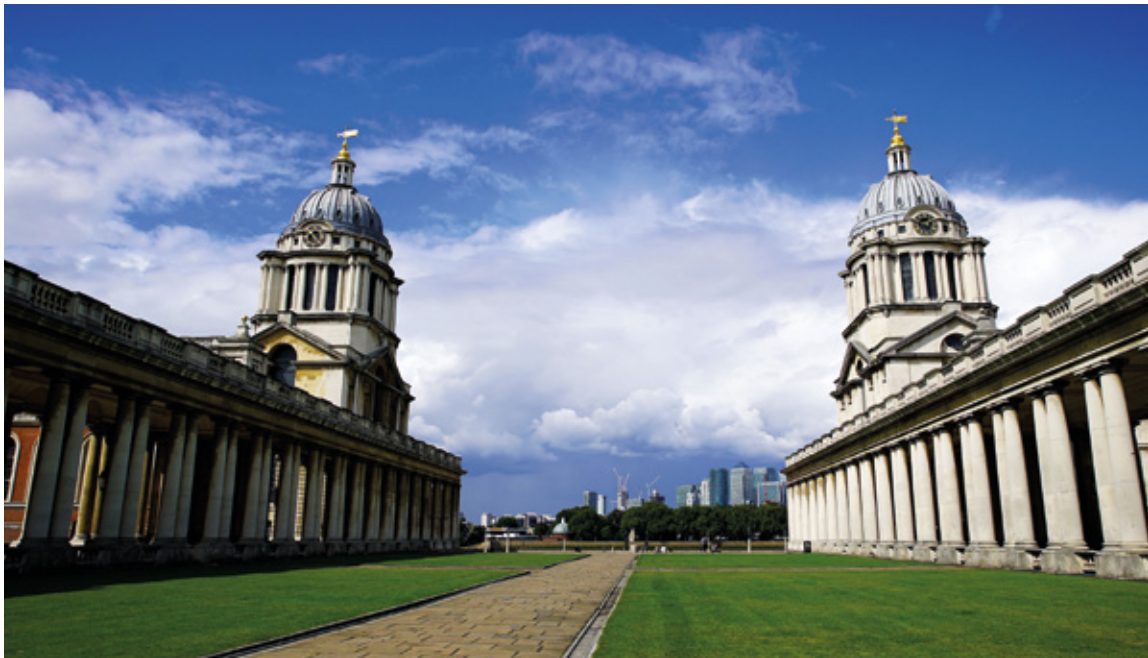
Right: The architectural centrepiece of the Maritime Greenwich World Heritage Site, the Old Royal Naval College boasts the Painted Hall, Chapel and Visitor Centre as well as historic grounds.