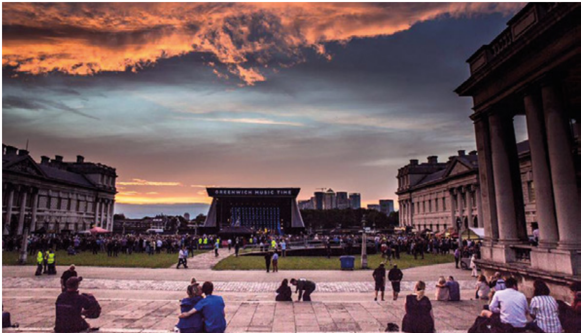
Right: The grand square transformed into a major London music venue during Greenwich Music Time.

Featuring editorial pieces by Old Royal Naval College staff, the blog offers a behind the scenes look at the Painted Hall during conservation and has become a significant driver of traffic to the website from the site's social media channels.