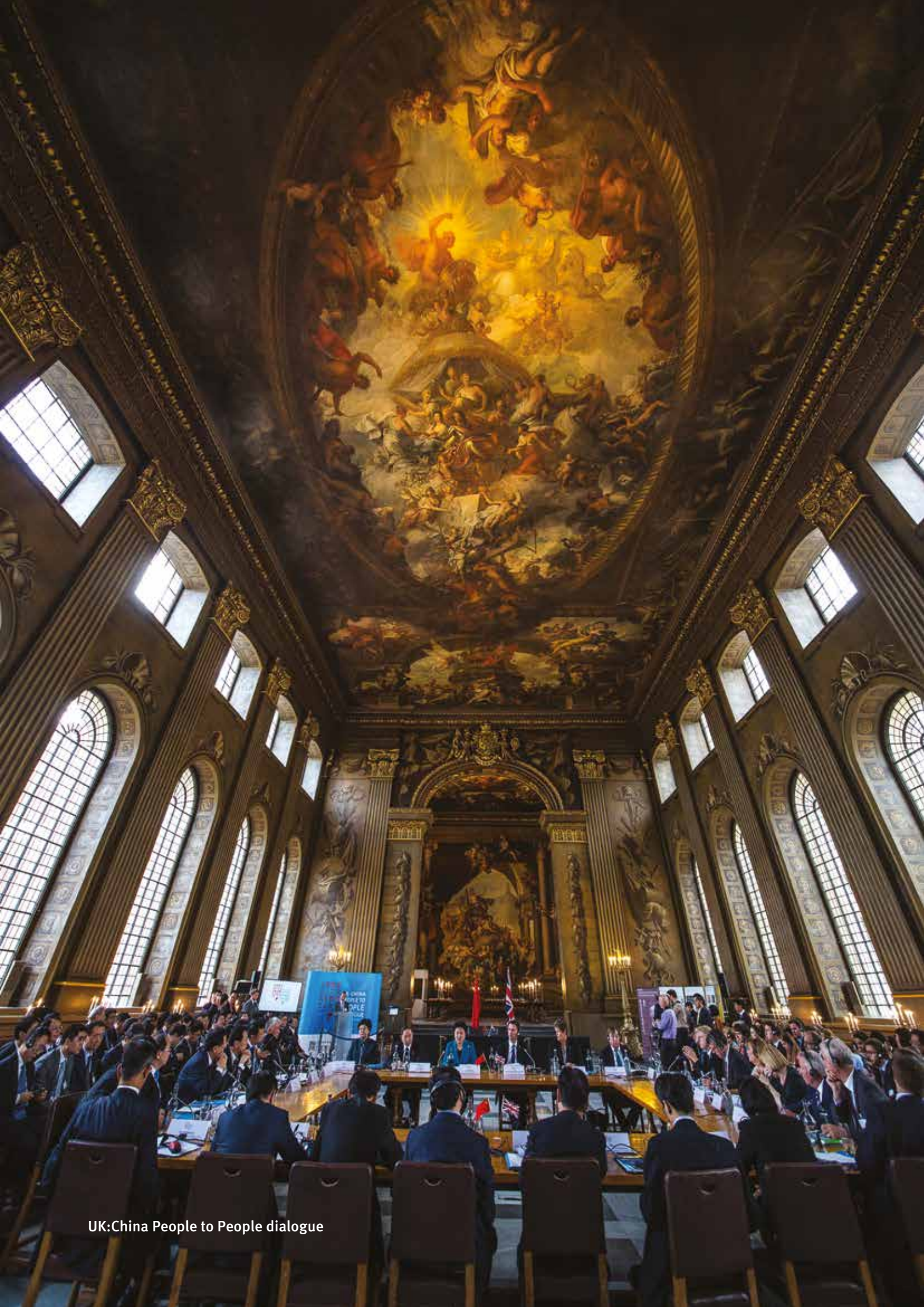
UK:China People to People dialogue