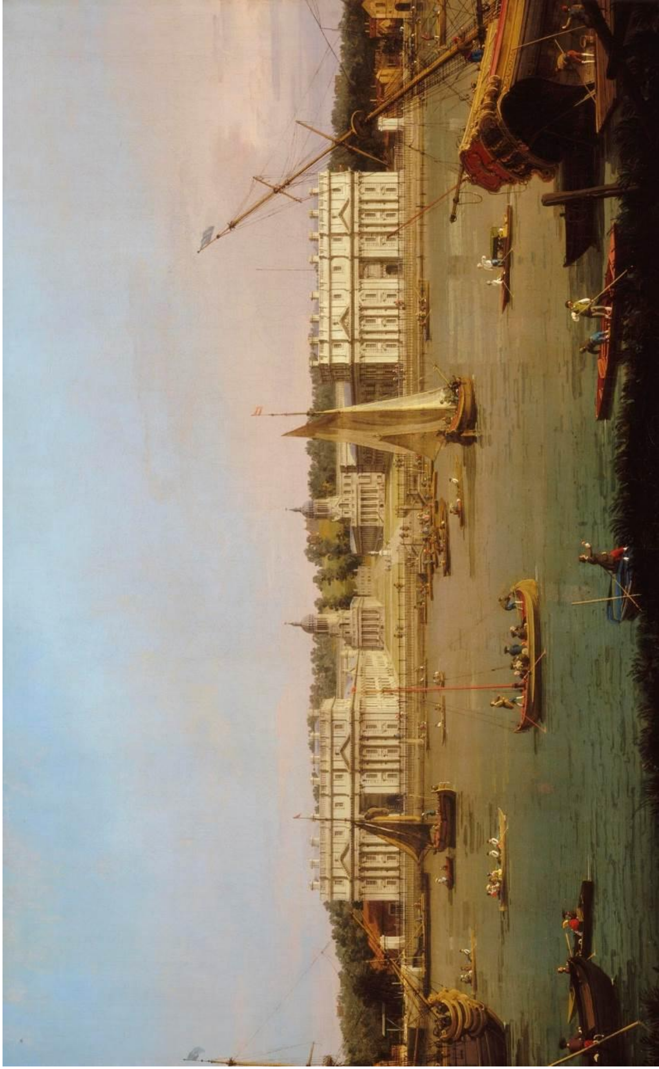
Image 1: Greenwich Hospital from the North Bank of the Thames, Canaletto, 1752.