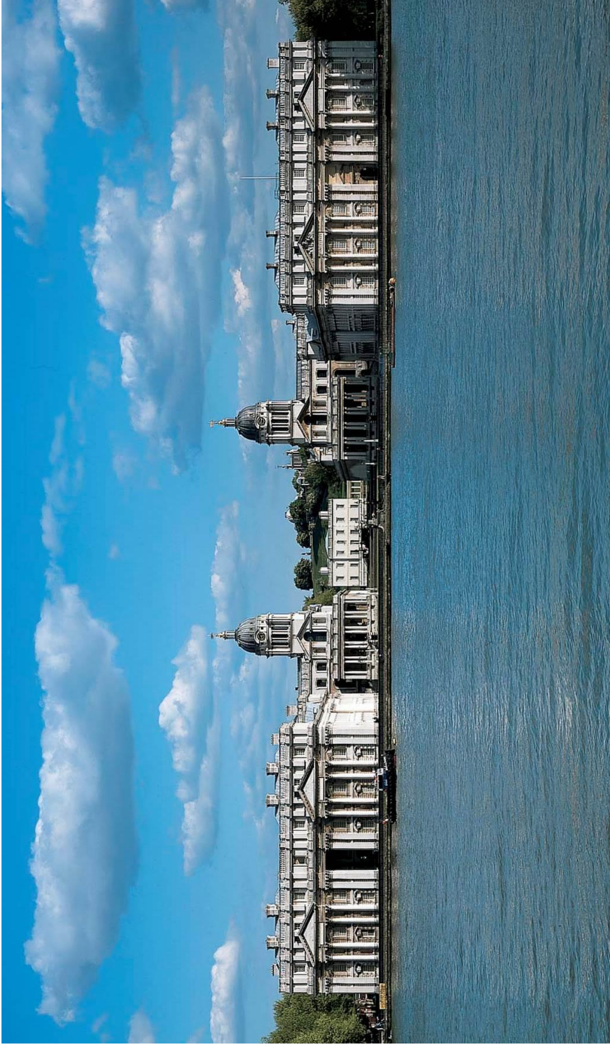
Image 2: View of the Old Royal Naval College today.