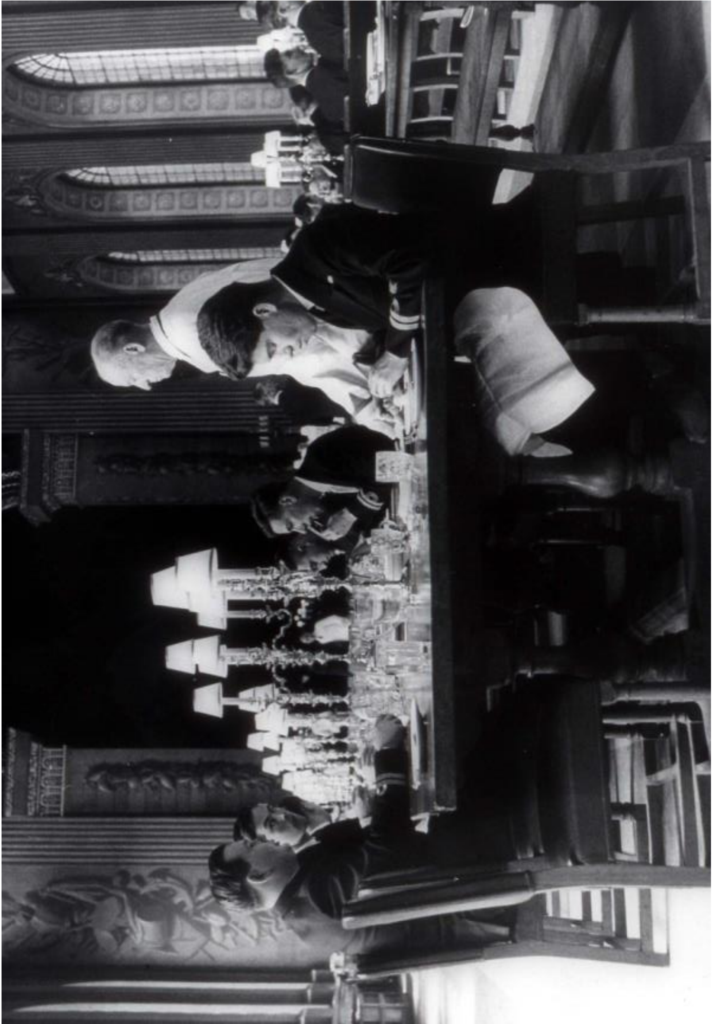
Officers dining in the Painted hall.