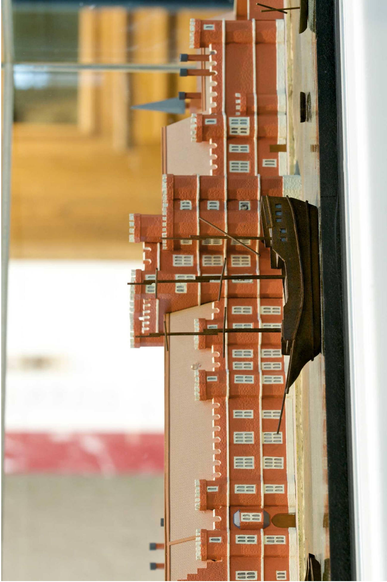
Model of the Old Greenwich Palace, Discover Greenwich.