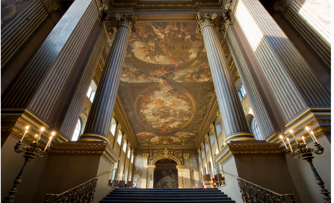
The Painted Hall at the Old Royal Naval College