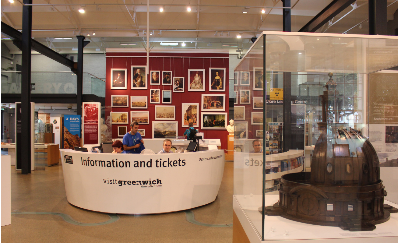
The Visitor Centre at the Old Royal Naval College