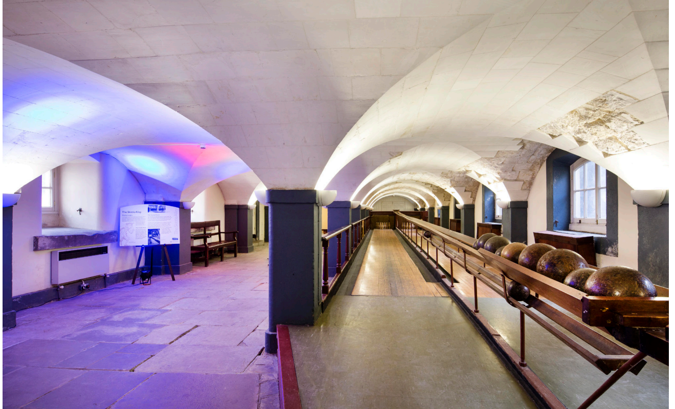
The Skittle Alley at the Old Royal Naval College