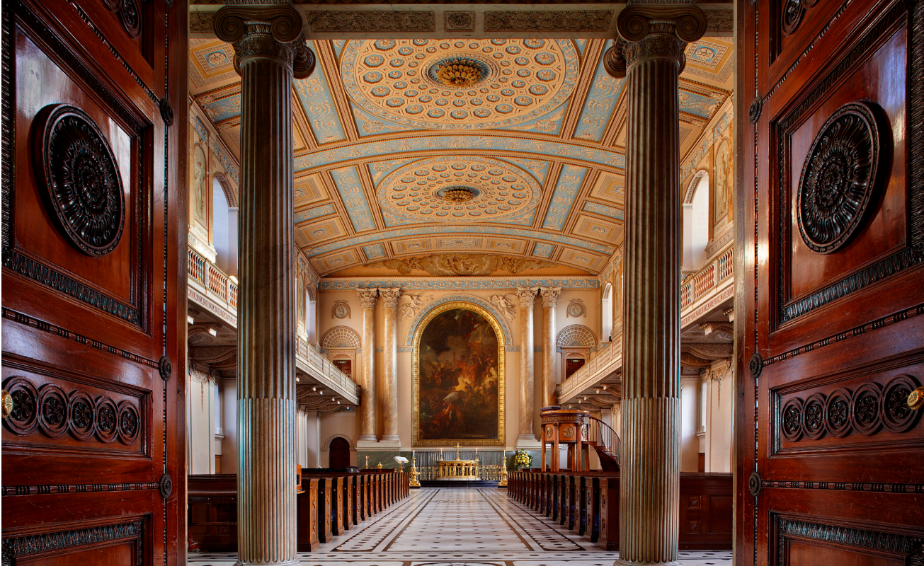
The neo-classical Chapel at the Old Royal Naval College